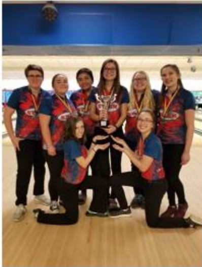
Girls bowling with a 3 rd place finish