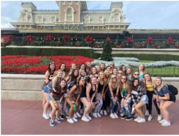
Our Dance team in Orlando!