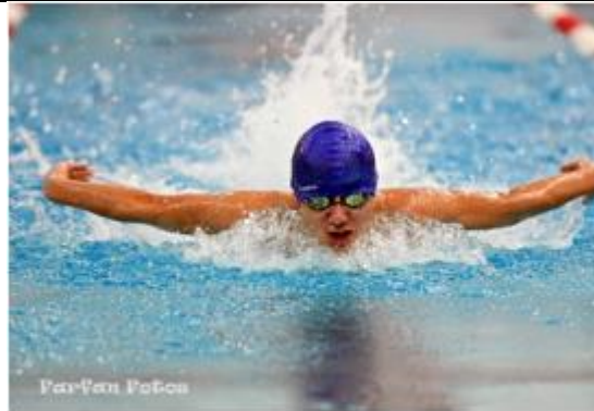
Boys Swimming in action at home.